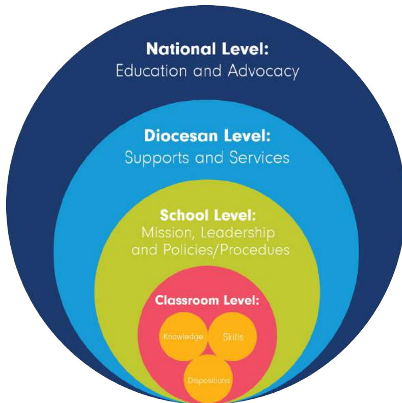
Figure A: Integrated Support System for Student with Disabilities in Catholic Schools (Boyle, 2016)